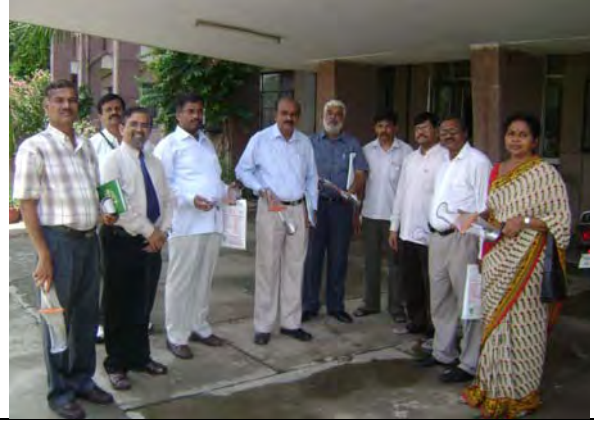
Visitors with CIPHET developed hand tool for banana comb cutting