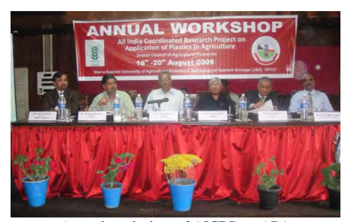
Annual work shop of AICRP on APA